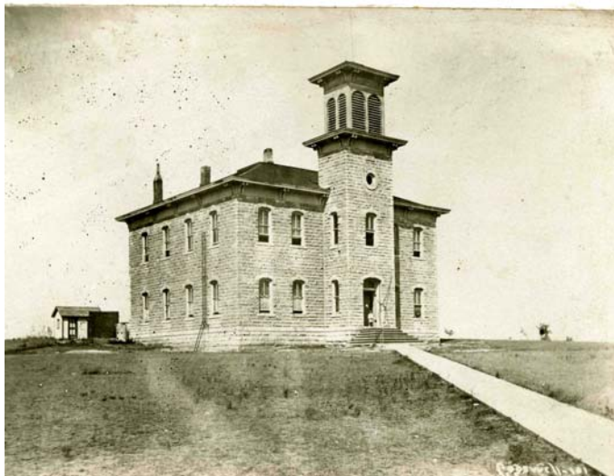
Original School, Built 1880